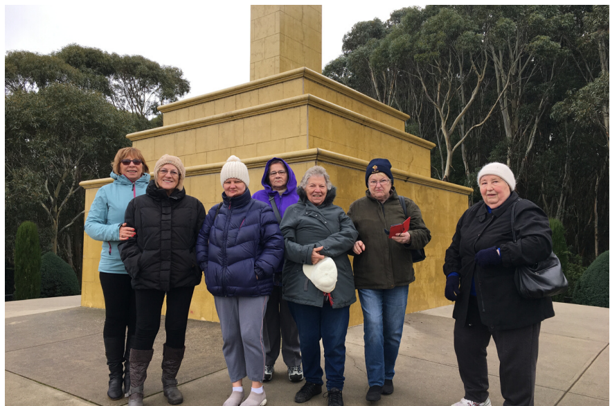
SSG Ardeer during excursion.