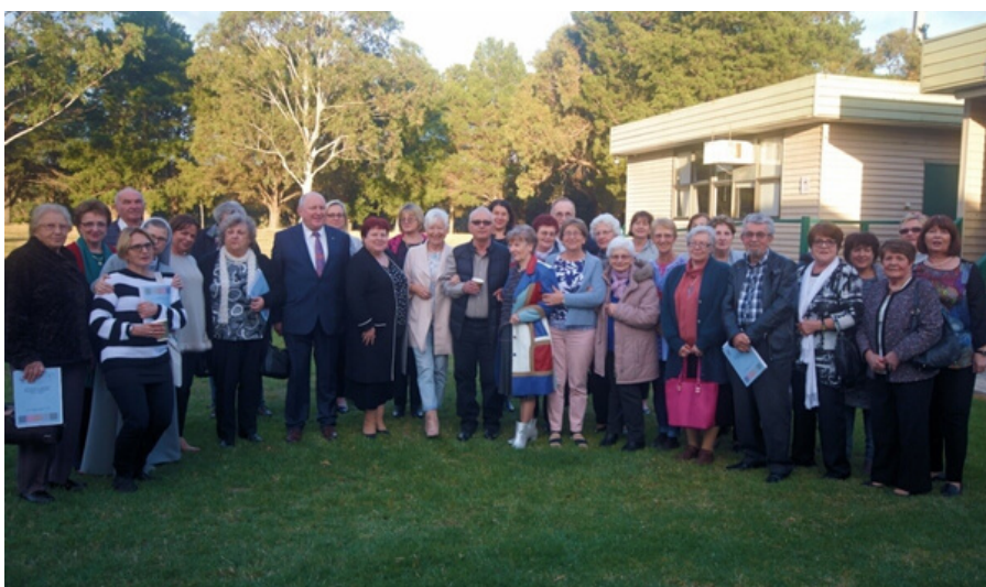
Volunteers of PCCV and PCCS.

Service System Development Program also helps community development and provides assistance to 20 Polish Seniors Clubs. The meetings are organized every two months for presidents of Polish Seniors Clubs, volunteers and carers. They have opportunities to undertake training, and exchange information and experiences. They also spend social time together.