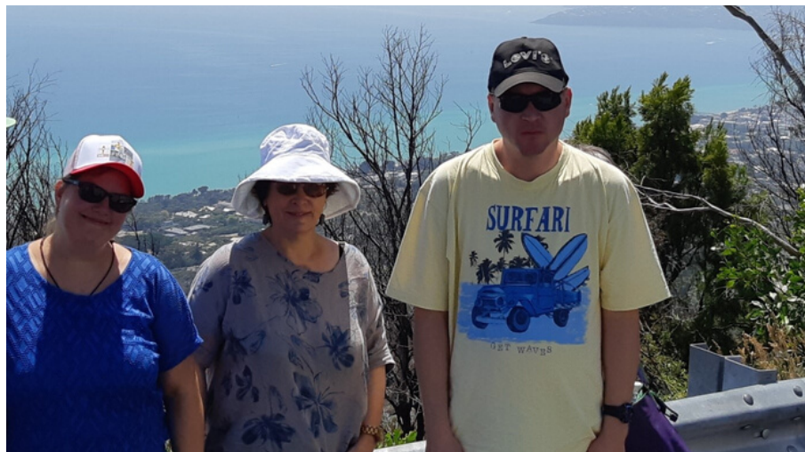
Excursion to Arthur's Seat.