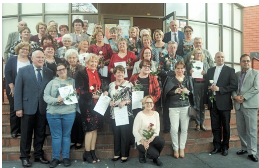
Volunteers of PCCV and PCCS.