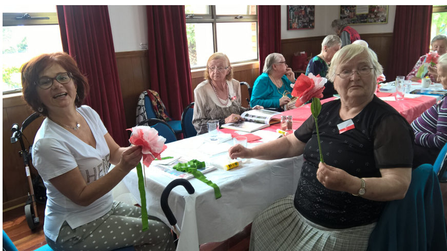
SSG Rowville during making a tissue flowers in Polish national colours: white and red.