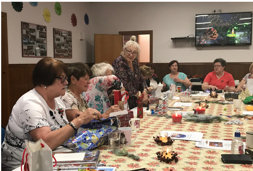
SSG RELAX Rowville during Christmas meeting.