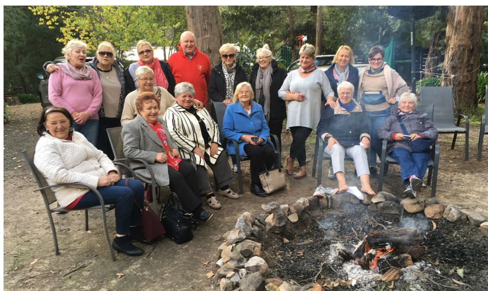
SSG SPORT Rowville in Polana Camp in Healesville.