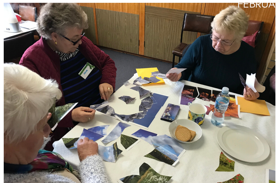
Ssg Ardeer during puzzle activity.