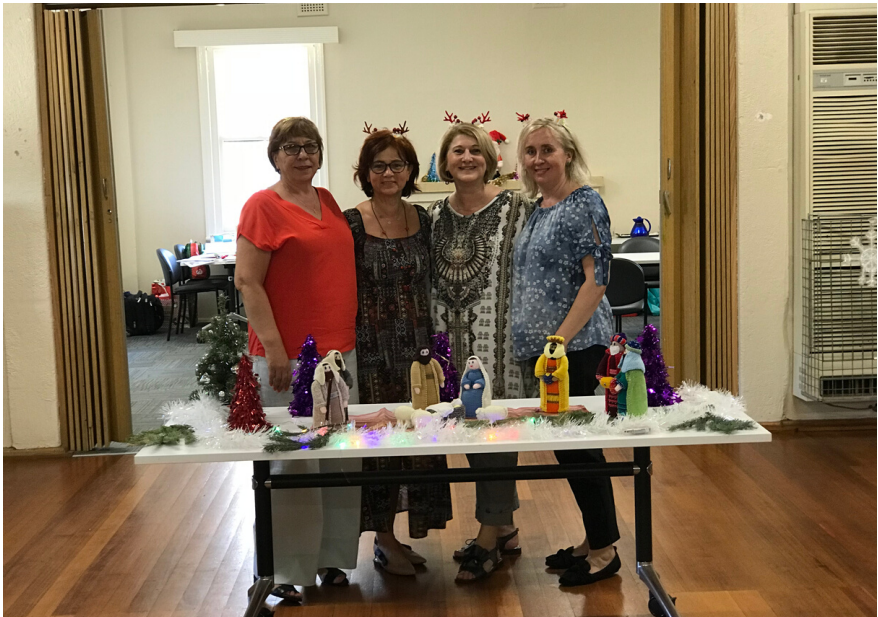
SSG Brunswick staff in a very merry mood.