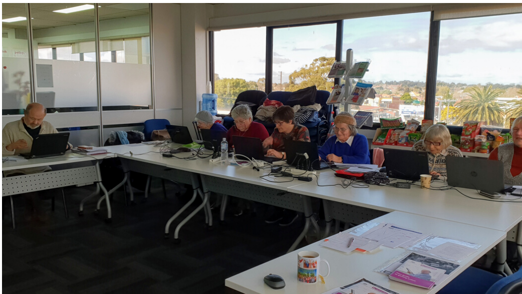
IT Group in Oakleigh during learning digital skills under the Be Connected program.