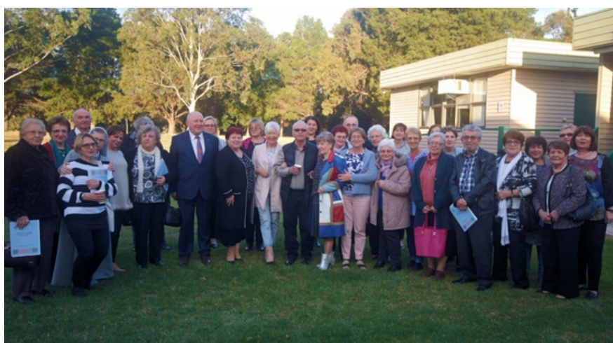
Celebration of the International Volunteers Day.