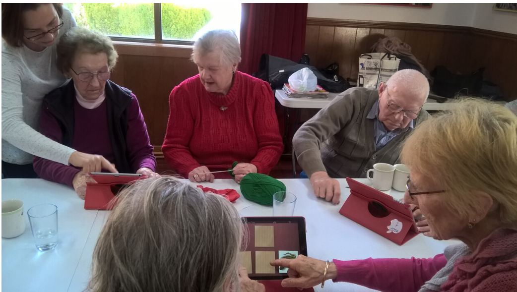
SSG Rowville during playing games on ipads.