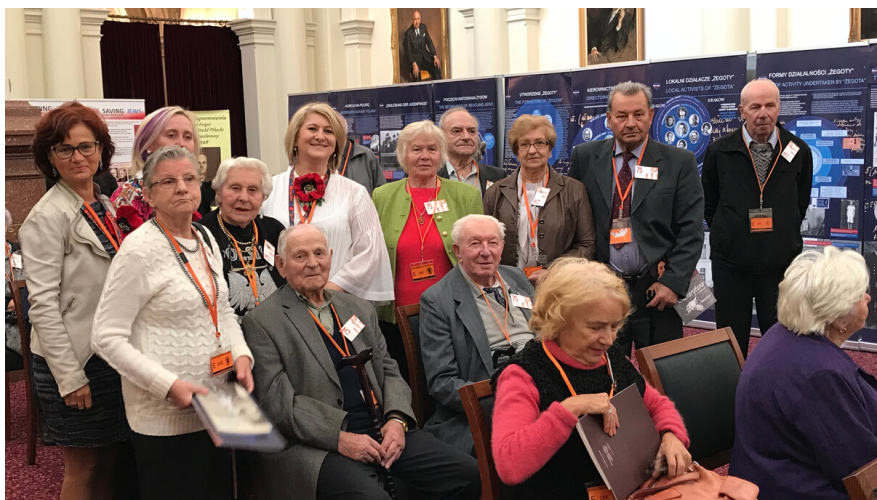
Volunteers, Presidents of Polish Seniors' Clubs and SSG Brunswick on the IPN's exhibition in the Victorian Parliament.