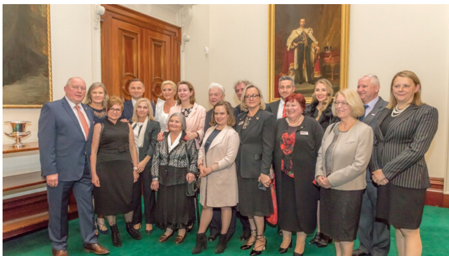
The Polish community during meeting with Mr. President and his wife at the Governor of Victoria during the first official visit of President of Republic of Poland in Australia.