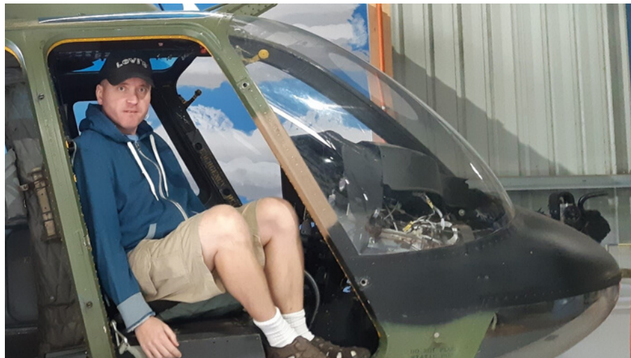
Excursion to Australian National Aviation Museum.