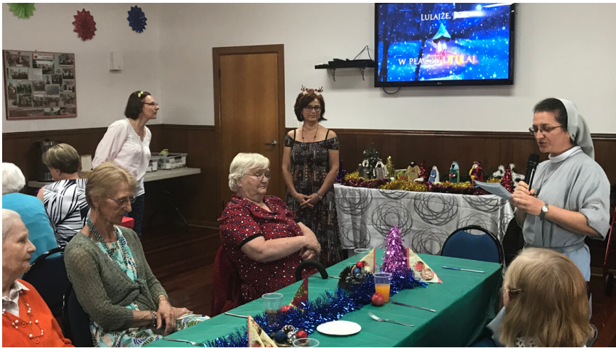
SSG Rowville during Christmas meeting.