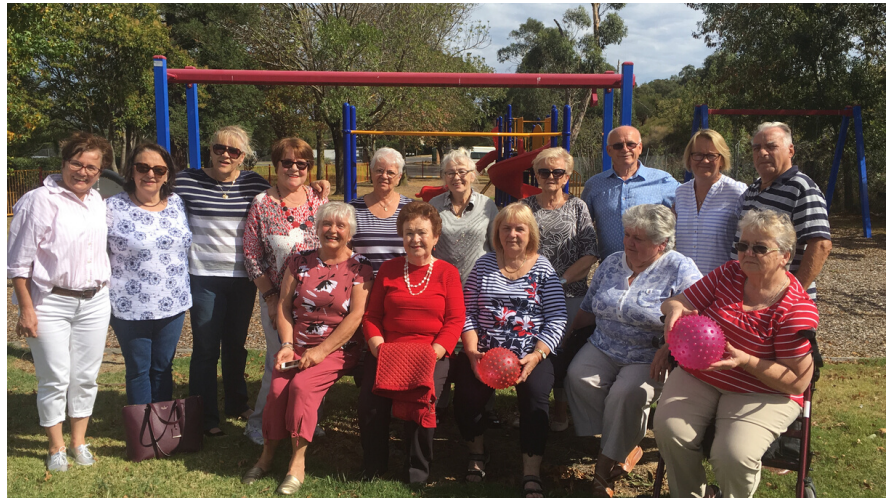
Ssg Sport Rowville during outdoor activity.