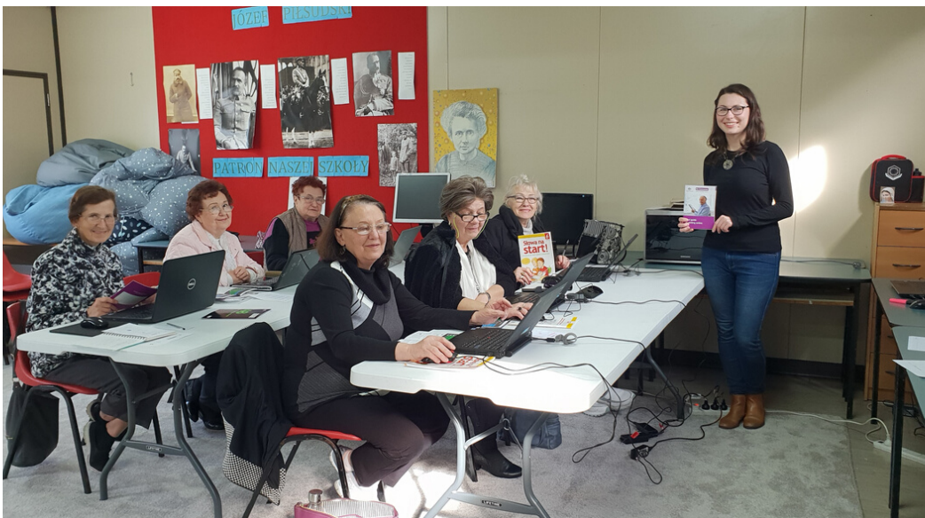
SSG RELAX Rowville during learning digital skills under the Be Connected program.