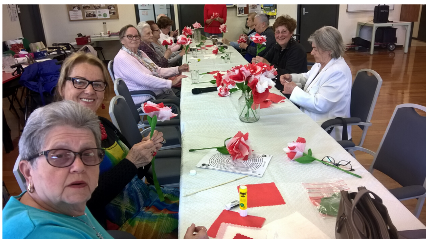
SSG Oakleigh during making tissue flowers in Polish national colours: white and red.