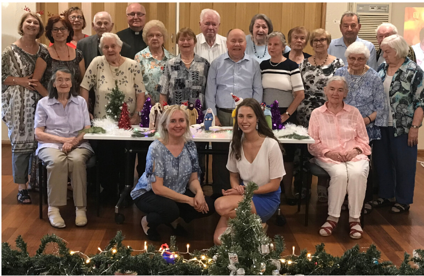
SSG Brunswick during Christmas meeting.