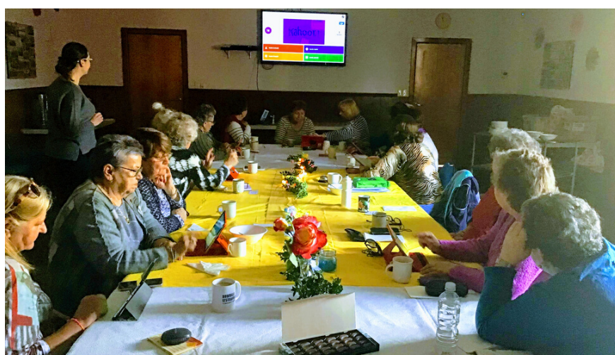
SSG RELAX Rowville during interactive activity with Easter quiz on Kahoot platform.