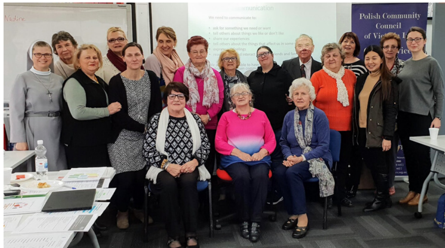
Training for volunteers provided by Swinburne University.