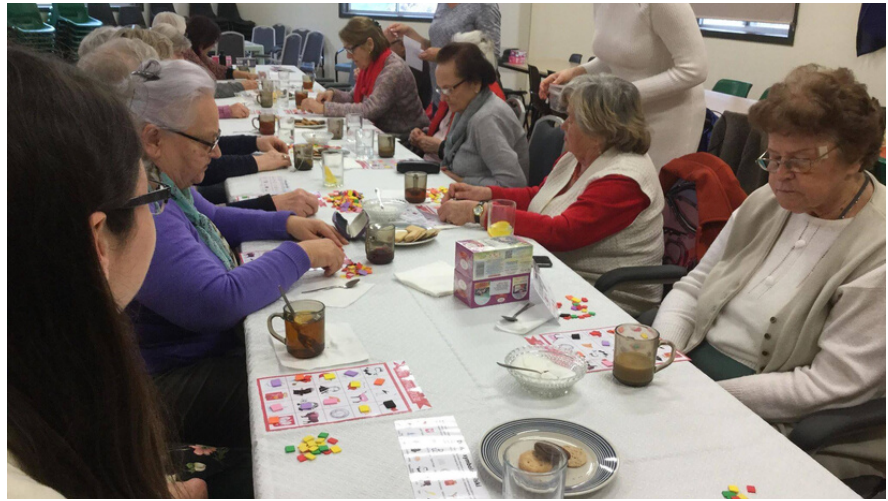
SSG Oakleigh during playing in Bingo.