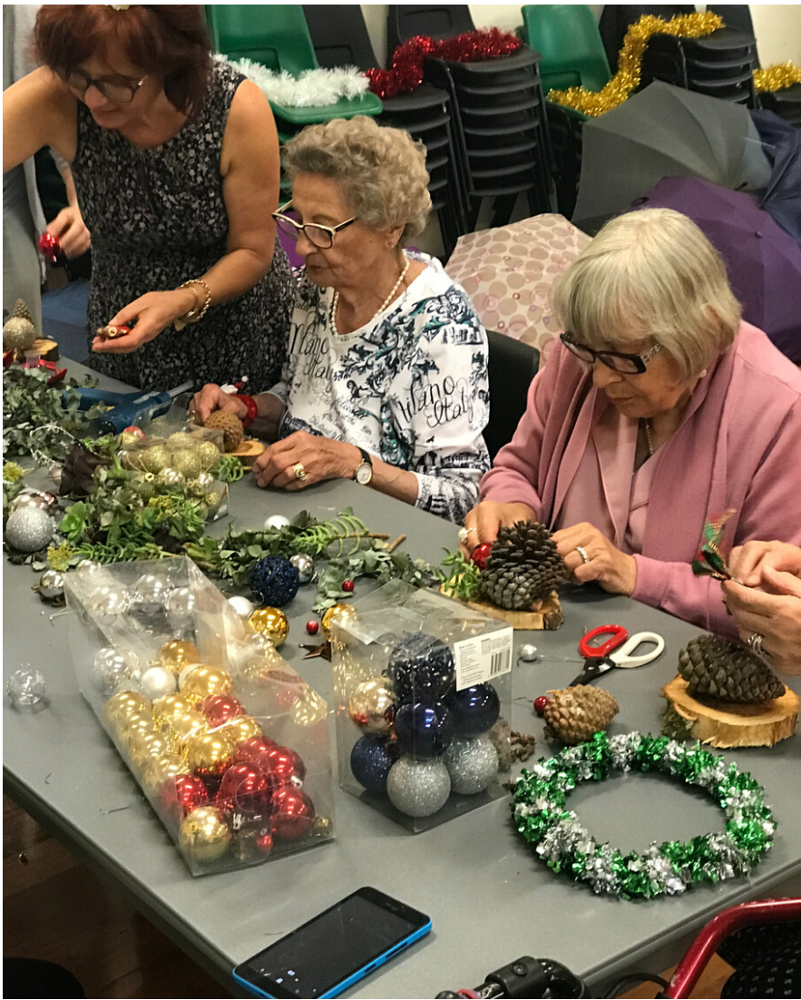
SSG Oakleigh during Christmas meeting.