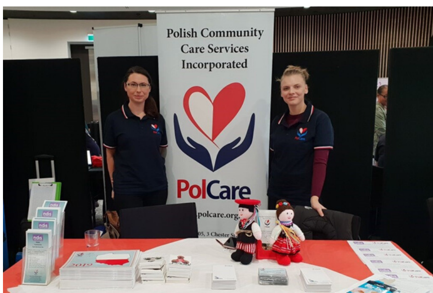
PCCS at Southern Region NDIS Service Provider EXPO.