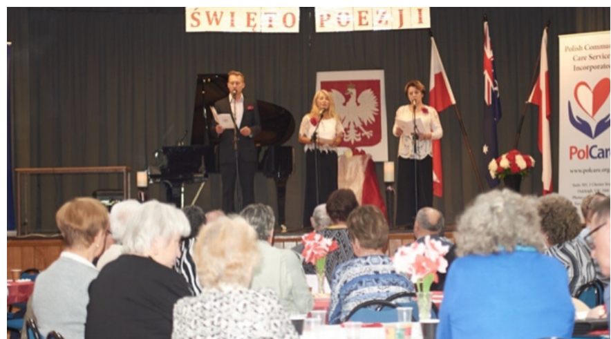
20th Seniors Poems Competition.