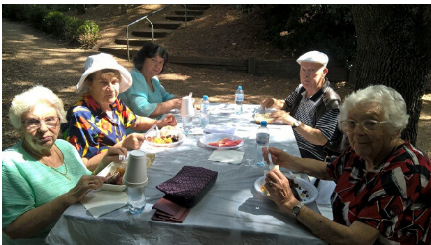
SSG Doveton during excursion to Wilson Botanic Park Berwick.