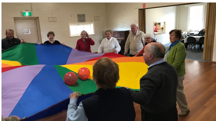
SSG Brunswick during playing with Kanza wrap.