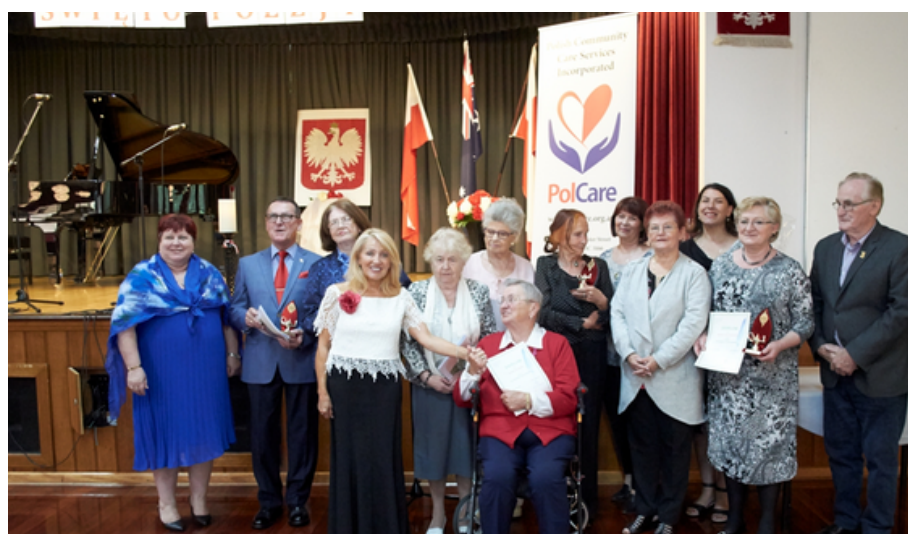
Participants of XX Jubilee Seniors Poems Competition.

XX Jubilee Seniors Poems Competition. Many excellent poems written by our seniors were entered into the competition. Results of the XX Seniors Poems Competition were announced on the 21st of November 2018 during the Seniors' Poems Celebration in Rowville. The winning poems were read out by actors from the "Prób Miniatura" theatre group.