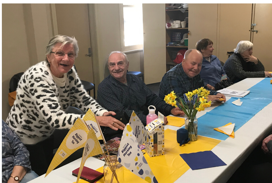
Supporting Cancer Council during Australian's Biggest Morning Tea.