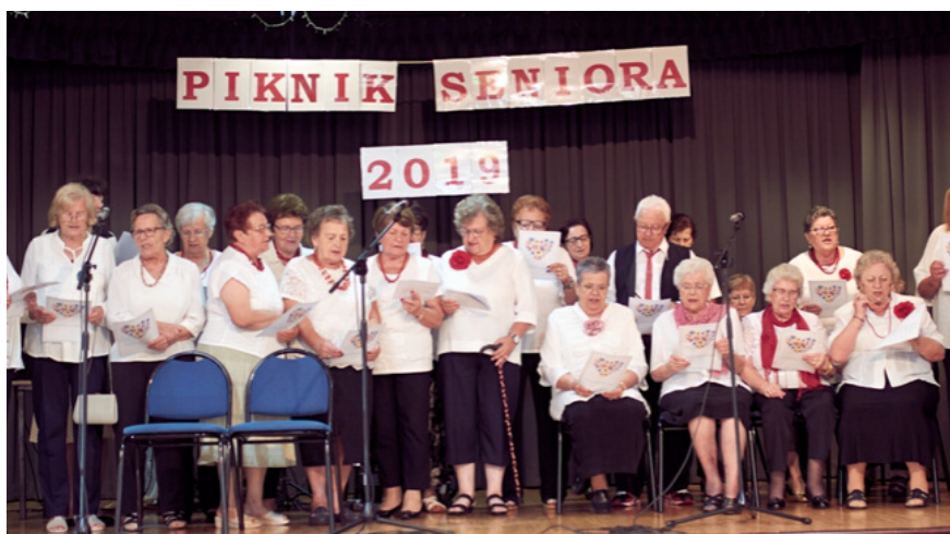
Seniors' Picnic in Rowville.