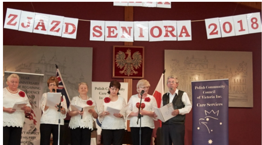
29th Seniors' Day in Polish Club in Albion.