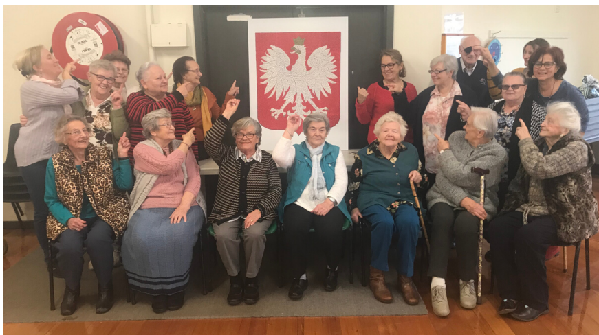
SSG Oakleigh with White Eagle – the Polish emblem which has been crafted by the SSGs Oakleigh, Rowville and Brunswick.