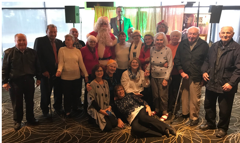
SSG Brunswick celebrating Christmas in July.