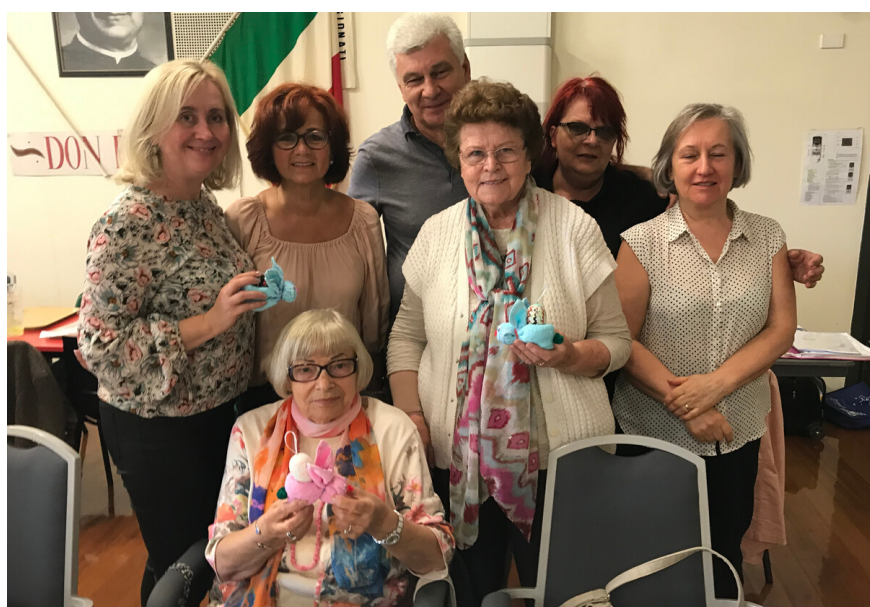
SSG Oakleigh during Easter meeting.