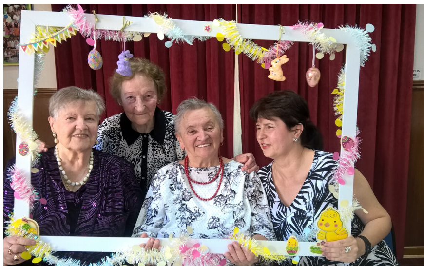
SSG Rowville during Easter meeting.