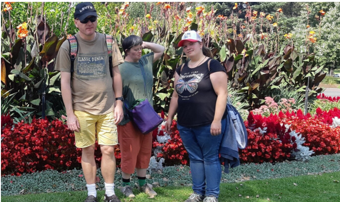
Excursion to Royal Botanic Garden.

During the year, we have been proud to support a growing number of participants, with the assistance of our Disability Support Workers, who have extensive experience in working within the community and disability setting. Furthermore, our Disability Support Workers have been able to provide exceptional care and support to enable participants to reach their goals, and be as independent as possible. All Disability Support Workers have the relevant qualifications and hold Certificate IV in Disability.