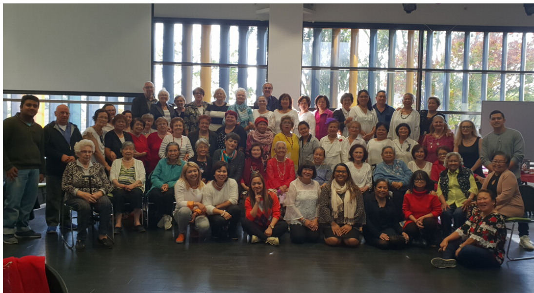
Meeting with Filipino Community - project "Love in any language".