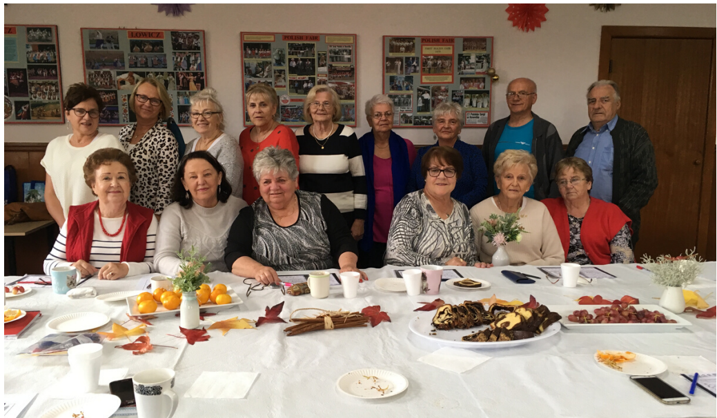
SSG SPORT Rowville

Throughout the year we have had up to 120 clients attend and participate in approximately 15,000 hours of activity time. Along with our group services, we offer transportation to and from SSG Rowville, Brunswick, Oakleigh and Doveton, via taxis and a company bus driven by our volunteers.