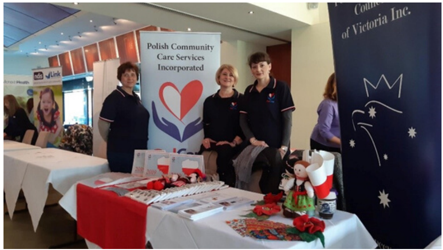
PCCS at Southern Metropolitan Region Alliance EXPO.